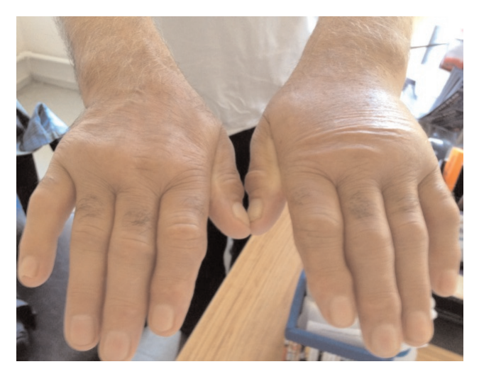
Figure 1— Before treatment.

A typical patient with RS3PE fulfills the following criteria: (1) bilateral pitting edema of the hands, feet or both, (2) sudden onset of polyarthritis, (3) age over 50 years, and (4) seronegativity for RF. RS3PE was described by McCarty in 1985 for the first time in eight aged men and two aged women with symmetric polysynovitis with acute onset. He found no evidence of erosions on radiographs. Serologic tests such as RF, antiCCP, and ANA were negative (1). The HLA-B7 phenotype is reported to be positive in patients with